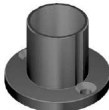
DELOLUX 50 x4 measuring adapter