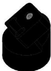
DELOLUX 503 measuring adapter