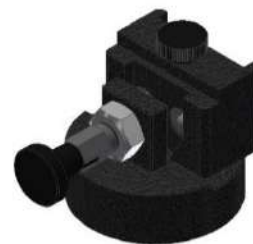
DELOLUX 502 measuring adapter