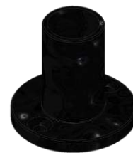
DELOLUX 505 measuring adapter