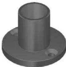
DELOLUX 50 x1 measuring adapter