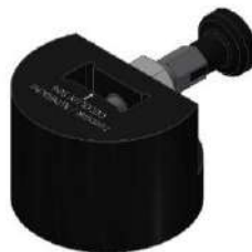
DELOLUX 504 measuring adapter