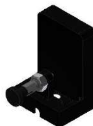
DELOLUX 301 measuring adapter