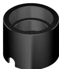
DELOLUX 80 measuring adapter